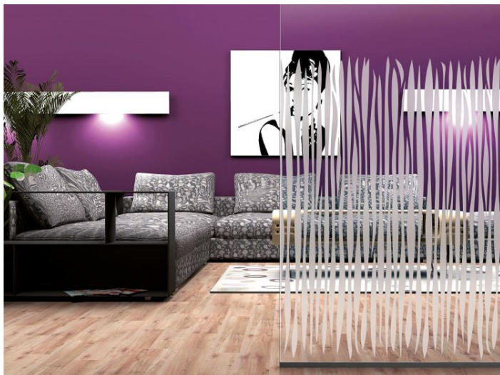
Lámina Decorativa INT 606