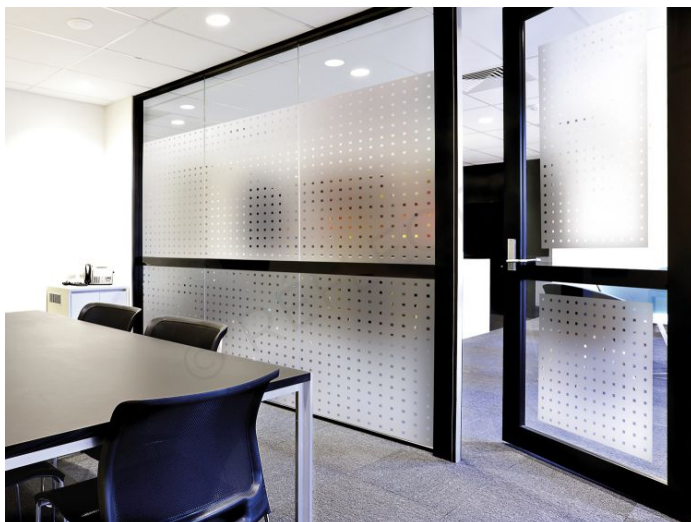
Lámina Decorativa INT 470