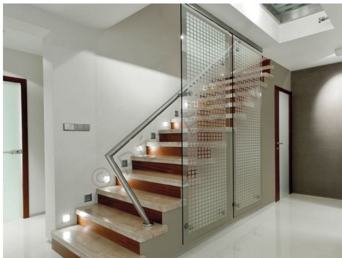
Lámina Decorativa INT 450