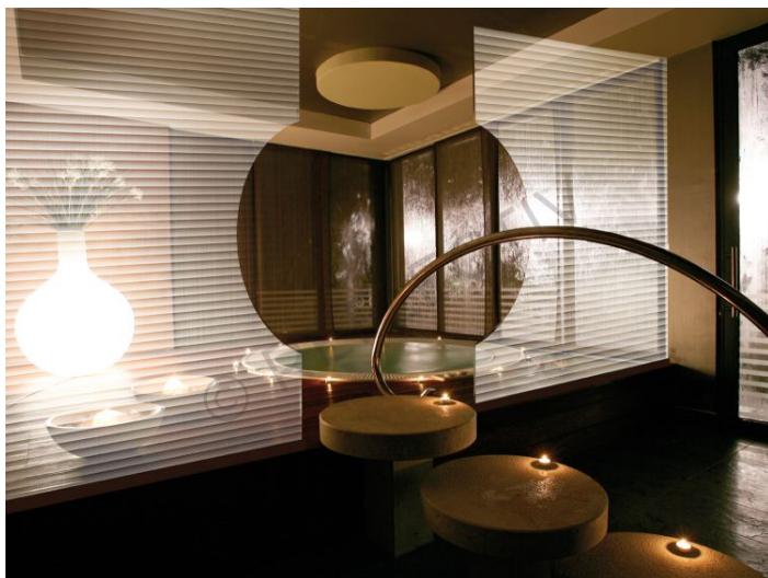
Lámina Decorativa INT 435