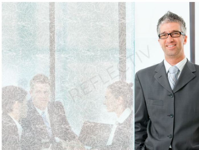
Lámina Decorativa INT 333