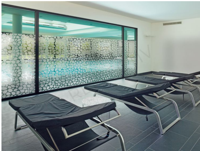
Lámina Decorativa INT 320

Material: PET 23 microns Adhesive: acrylic polymer 13 gr/m 2 Liner : siliconized polyester 23 microns Color : Frosted Application : internal Warranty: 10 years Application Temperature: min. + 5°C Fire Rating: B-s1,d0 Standards: Euroclasses Dimensions (of rolls) : 1.52 x 2.5 m 1.52 x 10 m 1.52 x 30 m