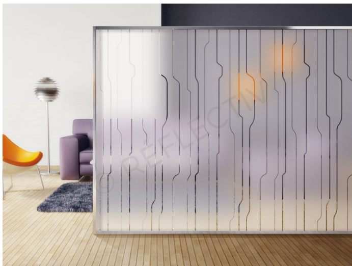
Lámina Decorativa INT 300