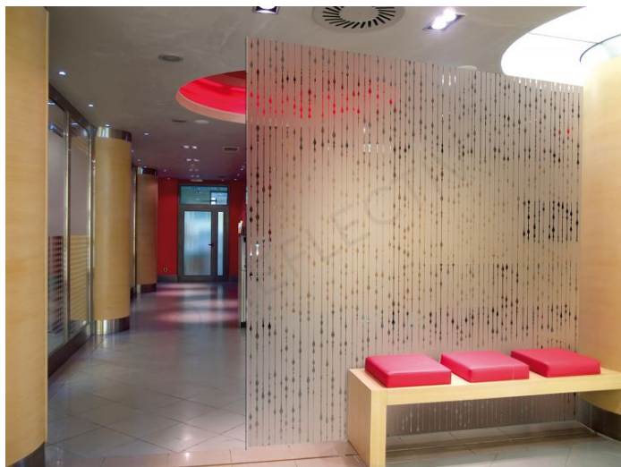
Lámina Decorativa INT 290