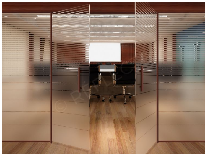
Lámina Decorativa INT 236