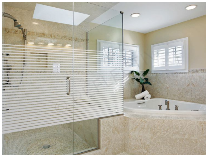
Lámina Decorativa INT 234