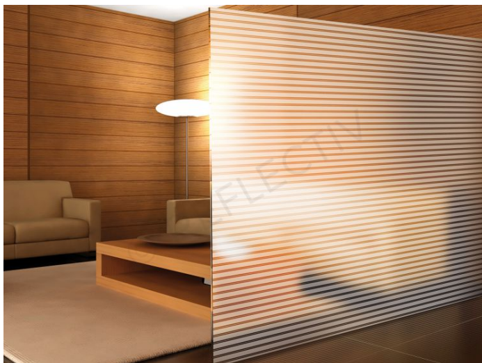
Lámina Decorativa INT 230