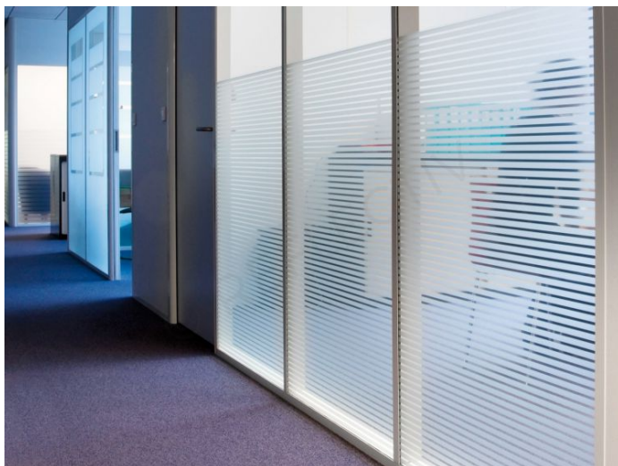
Lámina Decorativa INT 213