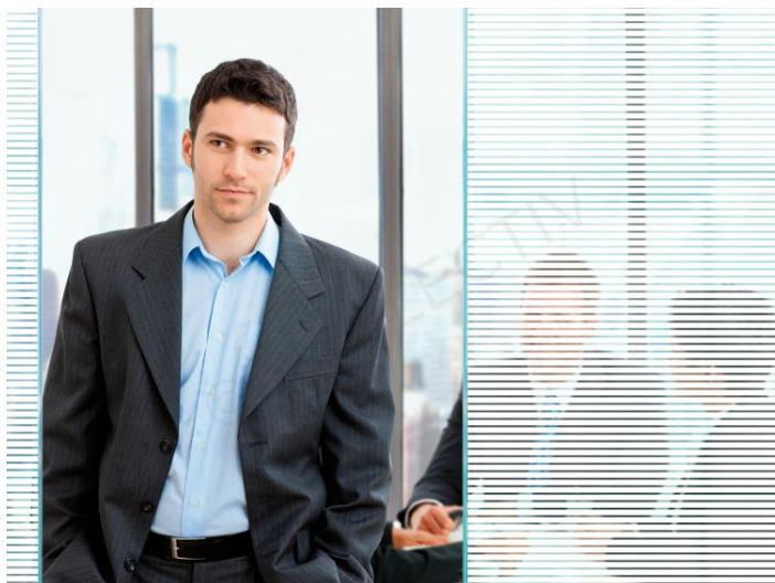
Lámina Decorativa INT 212